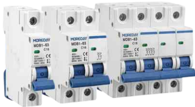
MCB SINGLE & THREE PHASE ALL TYPE