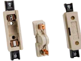
SONA PANEL 32 A FUSE / KIT KAT