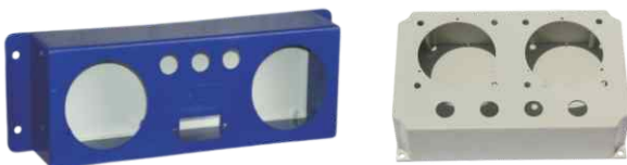
METERING PANLE MT BOX PVC/ METAL ALL TYPE