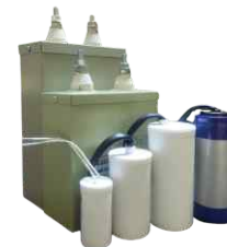
MFD CAPACITORS RUNING / STARING