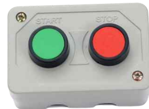
PS2 ON/OFF BOX