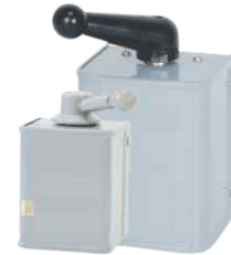
R / F L.T CONTROL SWITCHES