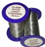
FUSE WIRE ALL TYPE