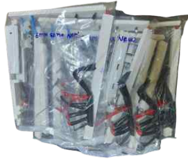
PANEL WIRING KIT ALL TYPE