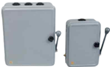
CHANGEOVER SWITCH ALL TYPE